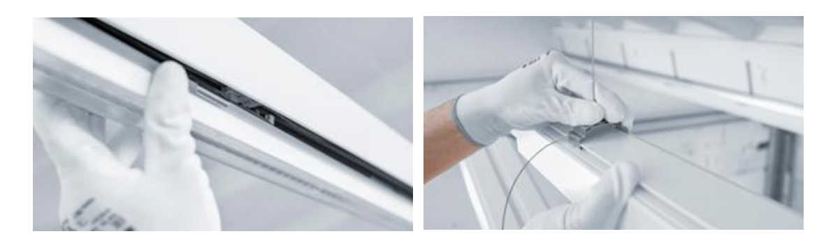
Fig. 3a + b: Up to 50 metres of the IP65 continuous-row system can be mounted in one piece. The trunking profiles, batten luminaires and lighting modules are all manufactured in metric dimensions.