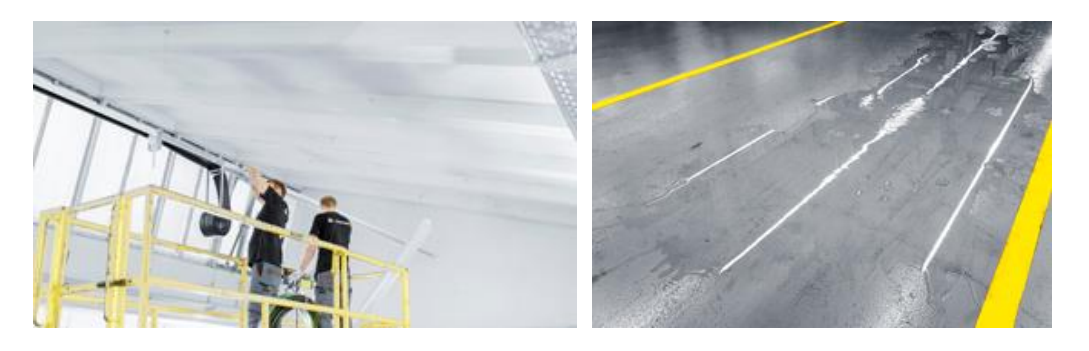
Fig. 4a + b: TRINOS breaks new ground by offering an effective trunking solution for industrial areas where the operational environment calls for a high degree of protection.