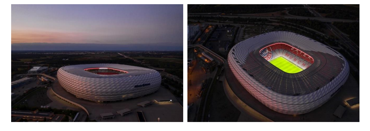
Fig. 1 + 2: Commissioning of the new roof area with new lighting technology of the Zumtobel Group.