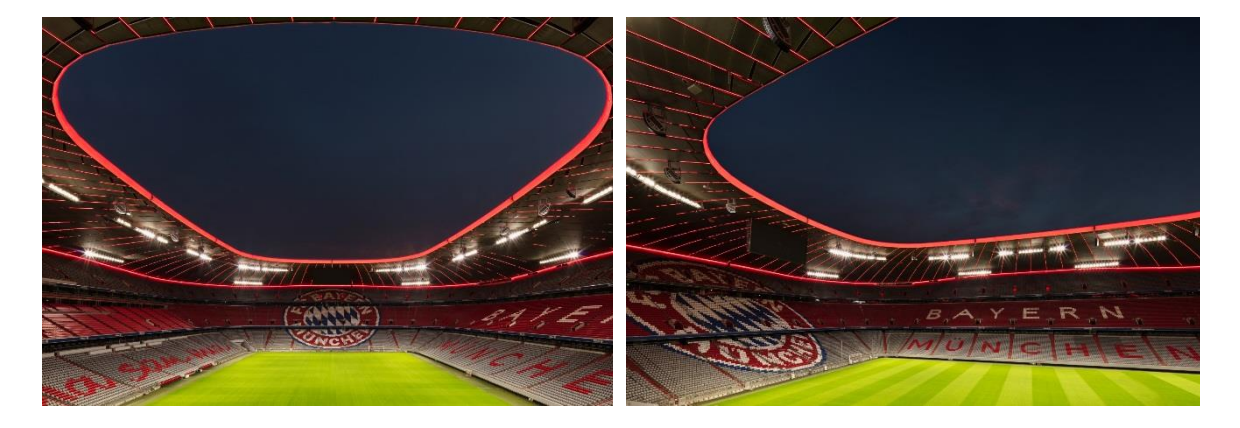
Fig. 5 + 6: The new Zumtobel Group effect lighting creates even more emotions in the Allianz Arena.