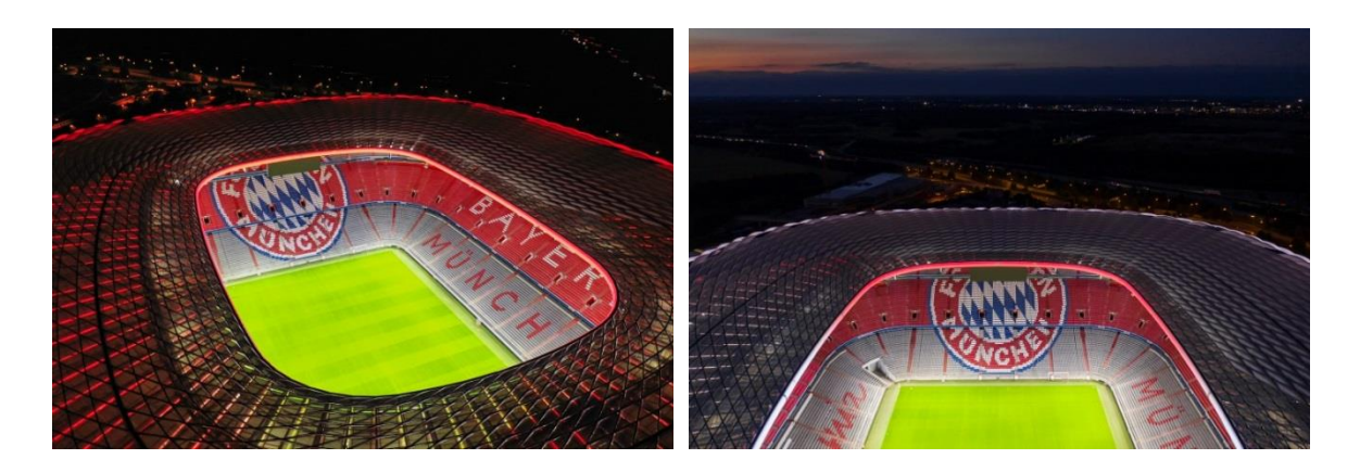
Fig. 3 + 4: As a full-range supplier, the Zumtobel Group provides a new lighting solution for the Allianz Arena Munich.