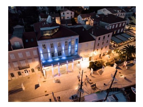
Photo 1: Muzej Apoksiomena is situated in the old Kvarner Palace of Mali Lošinj. Coloured rays of light emitted by IKONO LED wall luminaires from Zumtobel catch the eye as evening approaches.