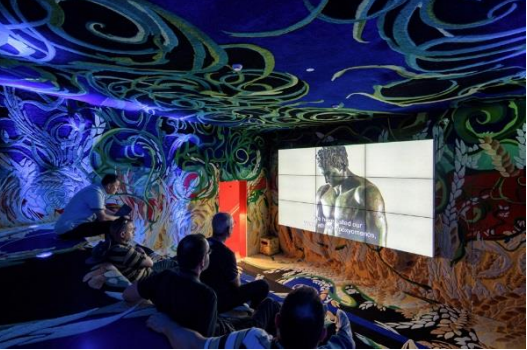
Photo 3: Floral patterns made from hand-woven merino wool create impressions of marine plants in the cinema. This aquatic imagery is reinforced by ground-recessed PASO II LED RGB luminaires.