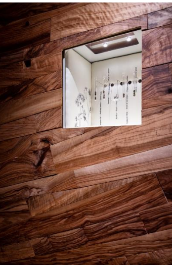
Photo 4: The MICROTOOLS LED lighting system accentuates a series of small display cases in the olive-wood wall, where items discovered inside the statue can be viewed.