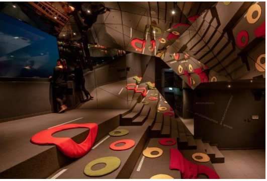
Photo 6: Visitors leave the main chamber and reach a kaleidoscopic-type mirrored room via a completely black stairwell that features a series of LINARIA light lines.