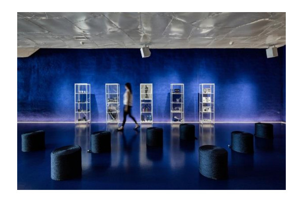
Photo 2: A room resembling the seabed with vivid cobalt-blue walls leads into the museum – staged perfectly using the SUPERSYSTEM II multifunctional LED tool.