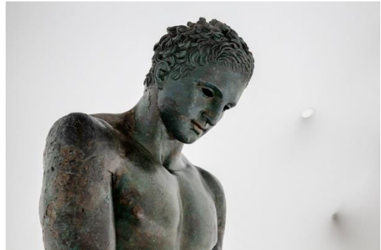
Photo 5: The white main chamber with Apoxyomenos is carefully illuminated using the CIELOS wide-area LED lighting system to avoid any hint of shadow.