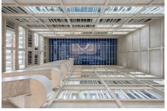
Fig. 2: Inside, two spectacular atriums offer stunning views up to the sky – all framed by a potent yet uncomplicated style of architecture.