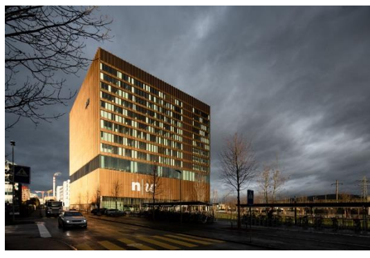
Fig. 1: Flanked by a tree-lined park and with an extensive forecourt, the 65-metre-tall cube looms over the neighbouring railway tracks. The copper-coloured façade shines invitingly in the sun.