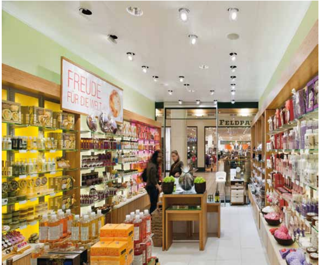
B3 | Panos Infinity LED downlights and Discus LED spotlights are among the most innovative LED luminaires within Zumtobel's product portfolio, setting new standards in terms of lighting quality and efficiency.