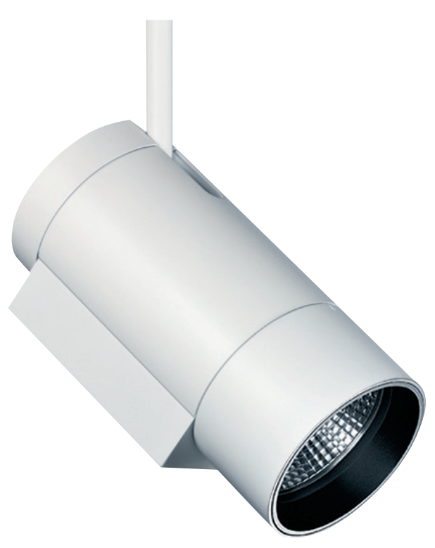
B3 I With the Arcos spotlight system, Zumtobel emphasises its high design ambition and innovative ideas. The extensive range gives architects and designers plenty of scope to create high-quality, customised lighting solutions.