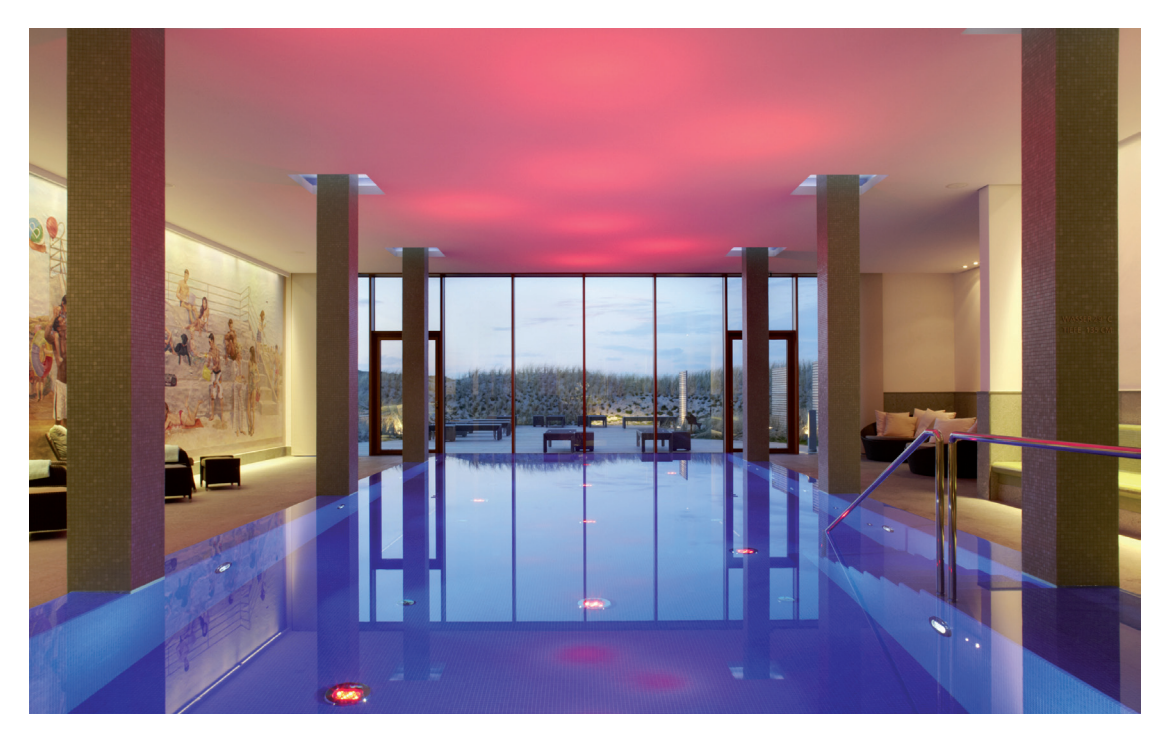
B1 I Light that makes people feel good: at its shared stand at "imm cologne", Zumtobel will present fascinating lighting solutions based on LEDs for contemporary interior designs.

Part of any proper interior design concept is light, with its multi-facetted lighting scenes and colours. At "imm cologne", the international furnishing show to be held in Cologne from 18-23 January 2011, Zumtobel will present a choice of LED products and exciting lighting installations. Jointly with the companies Grohe, DuPont and Hasenkopf, Zumtobel will present itself in the Pure Village, in hall 3.2. at stand B034.