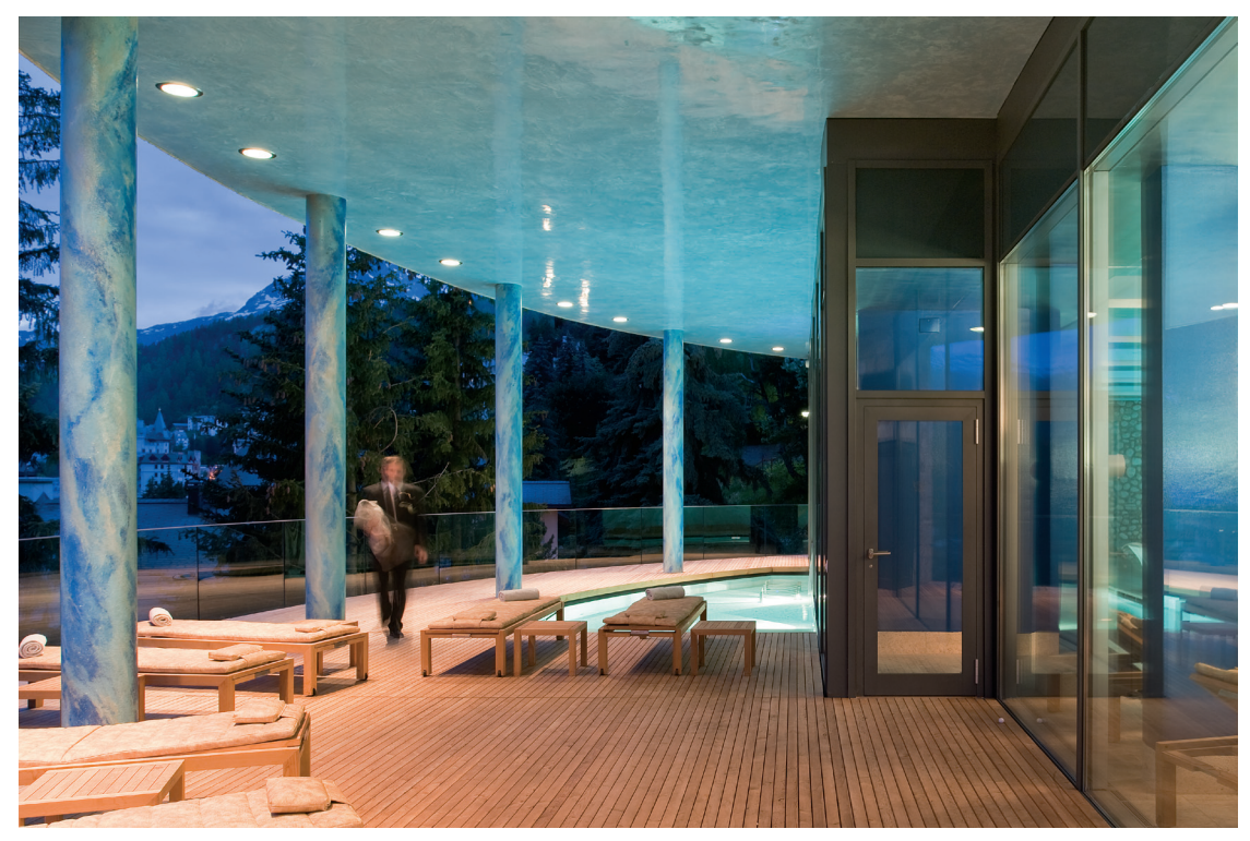
B2 I The right light to relax and feel good, in any mood. Based on a holistic approach, Zumtobel attaches great importance to well-engineered lighting concepts and consideration of the emotional impact of light.