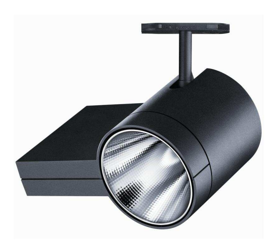
Caption 3: Round version of FACTOR