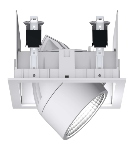
Caption 1: Single version of INTRO