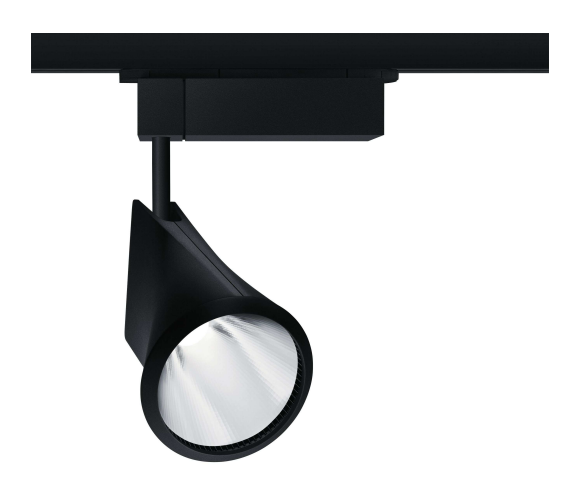
Caption 4: TrueGamutRendering-Technologie (TGR) will be initially available in the size M IYON spotlight.