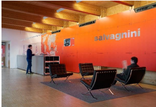
Photo 1: The new lighting installation at Salvagnini's headquarters in Sarego, Italy supports new concepts natural daylight, sets accents and skilfully highlights the architecture. The combination of indirect artificial light and natural light moments creates a unique atmosphere in the Salvagnini headquarters.