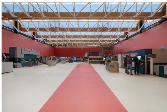
Photo 2: The heart of the building ensemble is an exhibition space that looks like a museum. The open hall appears like a prototype of an automatic, flexible factory in which Salvagnini produces all kinds of objects from sheet metal.

Photo 1: The new lighting installation at Salvagnini's headquarters in Sarego, Italy supports new concepts natural daylight, sets accents and skilfully highlights the architecture. The combination of indirect artificial light and natural light moments creates a unique atmosphere in the Salvagnini headquarters.