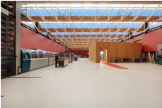
Photo 4: Together with the natural daylight coming in from above, the TECTON continuous-row lighting system creates an almost constant perfect light level in the hall. As soon as the sunlight decreases, artificial, indirect light compensates for this.