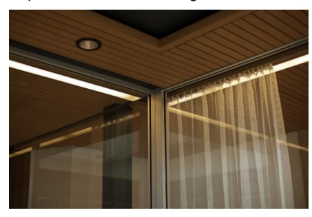
Caption 7: Zumtobel lighting solution at the german pavilion