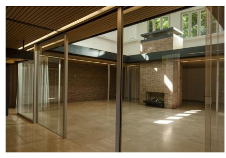
Caption 6: Interior view Bungalow Germania, Ciriacidis Lehnerer

Caption 5: External view of Bungalow Germania, Ciriacidis Lehnerer